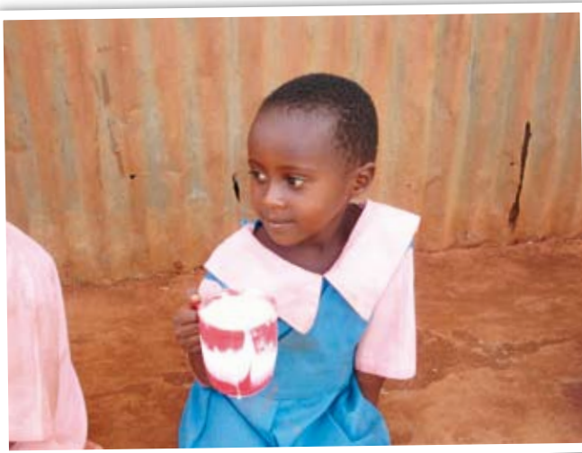
Supplementary feeding in Kenya thanks to you!