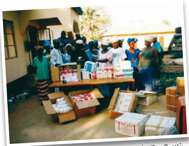
Malaria drugs arrive in The Gambia

conditions was often delayed. Children and pregnant women sometimes died because they were too sick to walk to the clinic or treatment came too late.