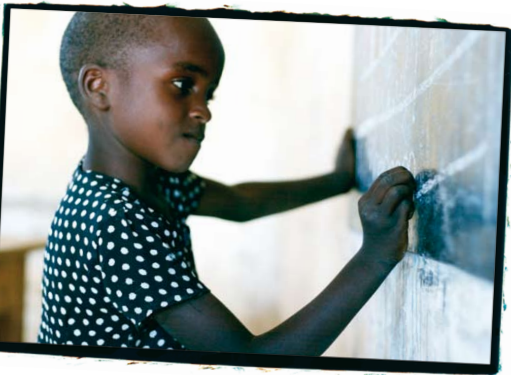
Gladys at the blackboard

HELP THE SCHOOL CHILDREN OF MUKUPI BY MAKING A DONATION TODAY!